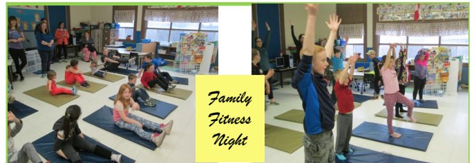
Family Fitness Night

We would like to remind parents that the door by the playground is locked at 8:00 a.m. each day. Students arriving after this time are recorded as tardy. If you are picking your child up after school, classes are dismissed at 2:00 p.m.