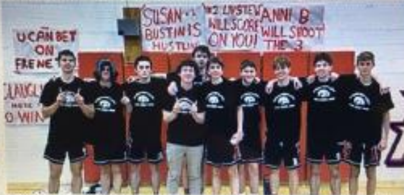
The 2021-22 Rothesay Rodhawks marked off their season strong, landing on the No. 1 spot in the province in AAA senior boys' basketball action.

in the south playing against the top two teams in the west. The top two teams from the regionals will face the top two in the east, with the winners of those games moving on to the provincial final.