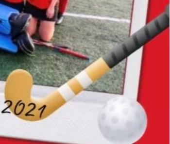
field hockey 2021