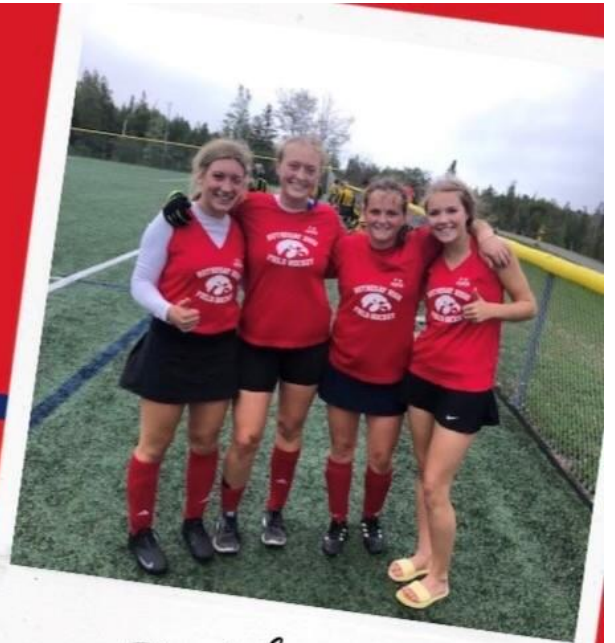
First home game