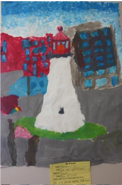
My Artwork Artist: [Name] Title: The red lighthouse Medium: [Medium] Date: [Date] What I loved about my art is: [Text]