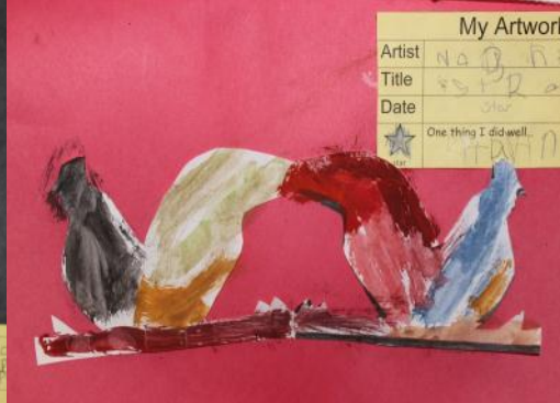
My Artwork Artist: [Name] Title: [Title] Date: [Date] ★ One thing I did well: [Text]