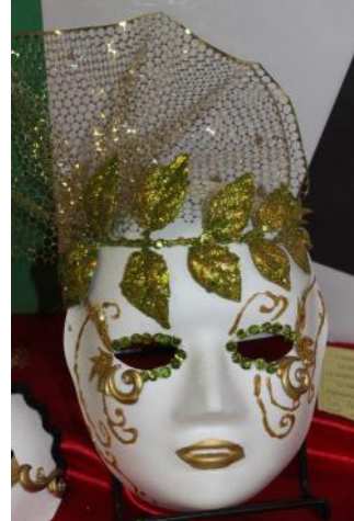
Artwork by 4/5Roul