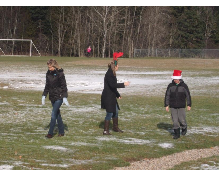
Santa Shuffle to raise money for the Empty Stocking Fund!