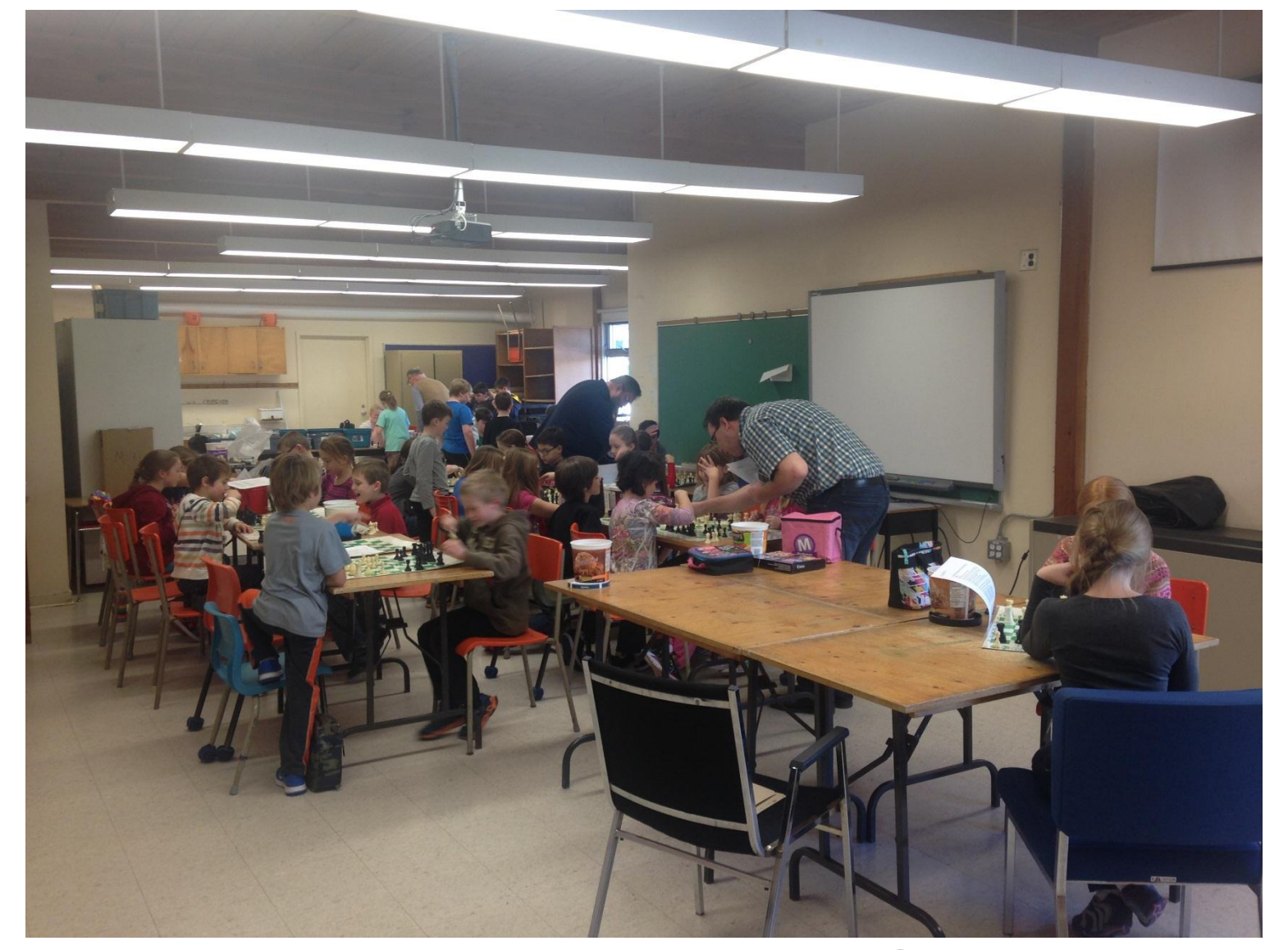
Chess Club Wednesday @ Noon Over 45 members!