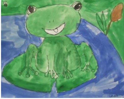
Art by 2 Salgado

Checking in when late or absent models, for children, a valuable 'life lesson' helpful in their teen and adult lives.