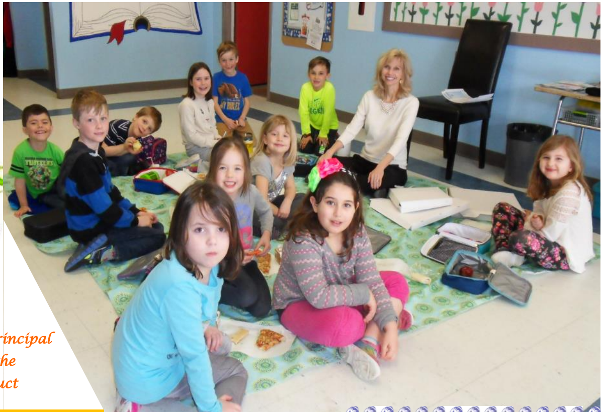
March Lunch with the Principal Celebrating the Code of Conduct

122 School Street Hampton, NB E5N 6B2 832-6022 (Office) carmelle.robichaud@nbed.nb.ca 832-6162 (Safe Arrival) 1-855-535-7669 (SNOW) http://asd-s.nbed.nb.ca http://leatherbarrow.nbed.nb.ca