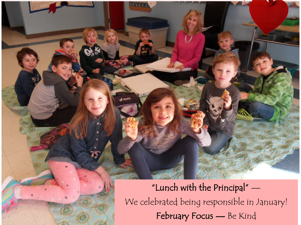
"Lunch with the Principal" — We celebrated being responsible in January! February Focus — Be Kind