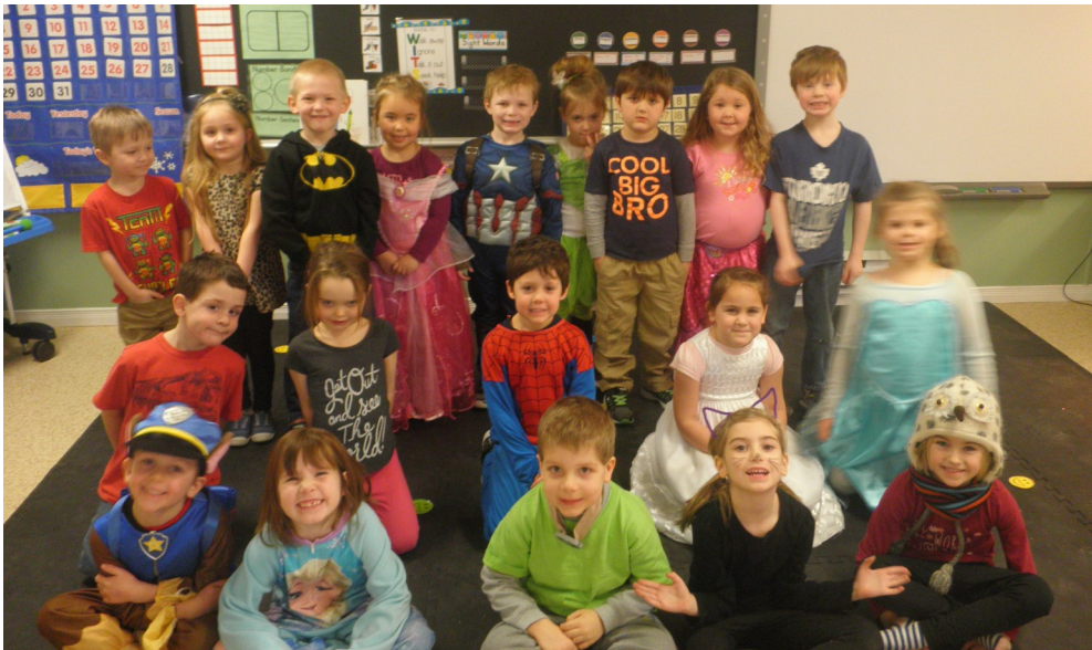
We had a lot of fun dressing up in our favorite book character costumes.