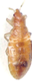
Fifth Stage Larva (4.5 mm long) Takes a blood meal then molts.