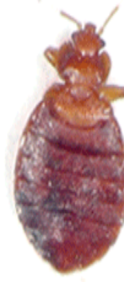
Adult (5.5 mm long) Takes repeated blood meals over several weeks.