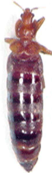
Adult Female (6.5 mm long) Females lay up to 5 eggs per day, continuously.