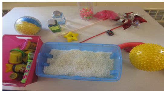
Mindful Zone and tools located outside the gym at the Lincoln Elementary Community School.