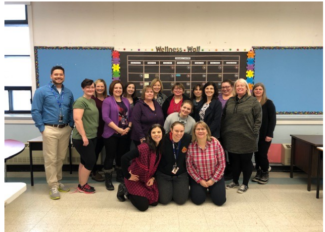
Top: Some of the NMS teachers and staff that are participating in the wellness challenge.