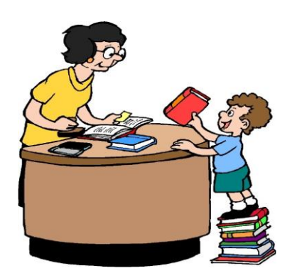
Page 17 of 27