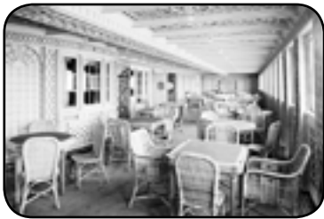
A Parisien-style café and below, a pool, both for the use of First-class passengers.