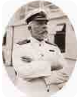
Above, Edward J. Smith, the captain of R.M.S. Titanic, on board the ship before it sailed. Captain Smith died on April 15th, 1912, going down with his ship.