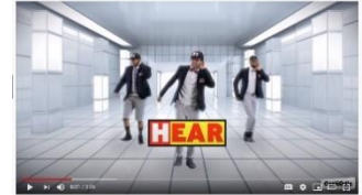
Bye Bye - Blazer Fresh | GoNoodle

Watch the YouTube video clip “Bye Bye Buy - Blazer Fresh | GoNoodle”