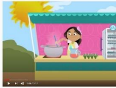
States of matter for kids: "What are the states of matter? Solid, liquid and gas"

For continued learning, check your Epic mailbox, and watch the YouTube video “States of matter for kids - What are the states of matter? Solid, liquid and gas”.