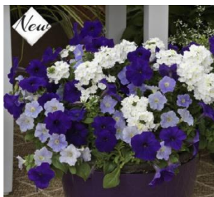
Porch Swing Mix: Dark blue and light blue Petunias with white verbena $15

Thank You for supporting various clubs, activities, and sports at FMS!