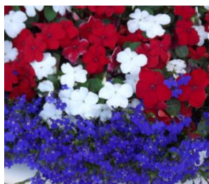
Red/White/Blue Impatiens with Lobelia $15