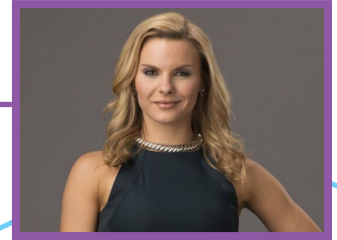
MICHELE ROMANOW, SHAD 2003 Serial entrepreneur Co-founder, Clearbanc Co-founder, SnapSaves (acquired by Groupon) Dragon on CBC's Dragons' Den

Go behind the scenes of Dragons' Den and see why Michele says she wouldn't be sitting there today without SHAD.