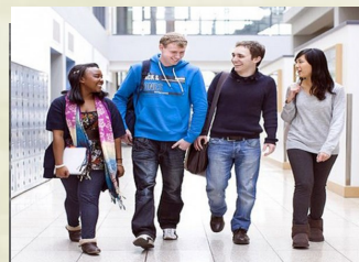
Brisk walking can elevate heart rates and improve cardiovascular health

"so we're well on our way to a healthier lifestyle here at SV with these fifteen minutes a