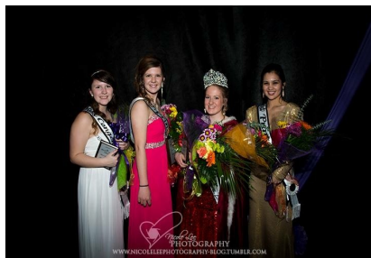
Queen's Court , 2015