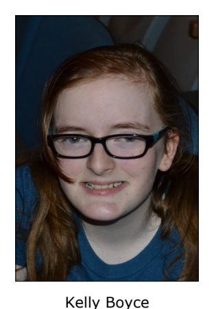
"SCENES is a great opportunity to enjoy some funny entertainment."