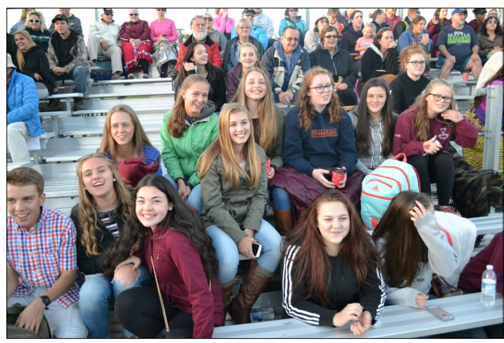
Perfect weather to watch football.

Harbour View High School's football team finished their season this month. They had a great year, and played very hard. In October, the team had