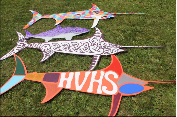
Anglophone South School District hand-painted over 250 fish that will hang from the rafters in the City Market until late 2013, after which time they will be auctioned off to support the Harbour Lights Campaign. HVHS has four fish on display - these were painted by Kylie Fox, Katie Shave & Kerrie Doucette.