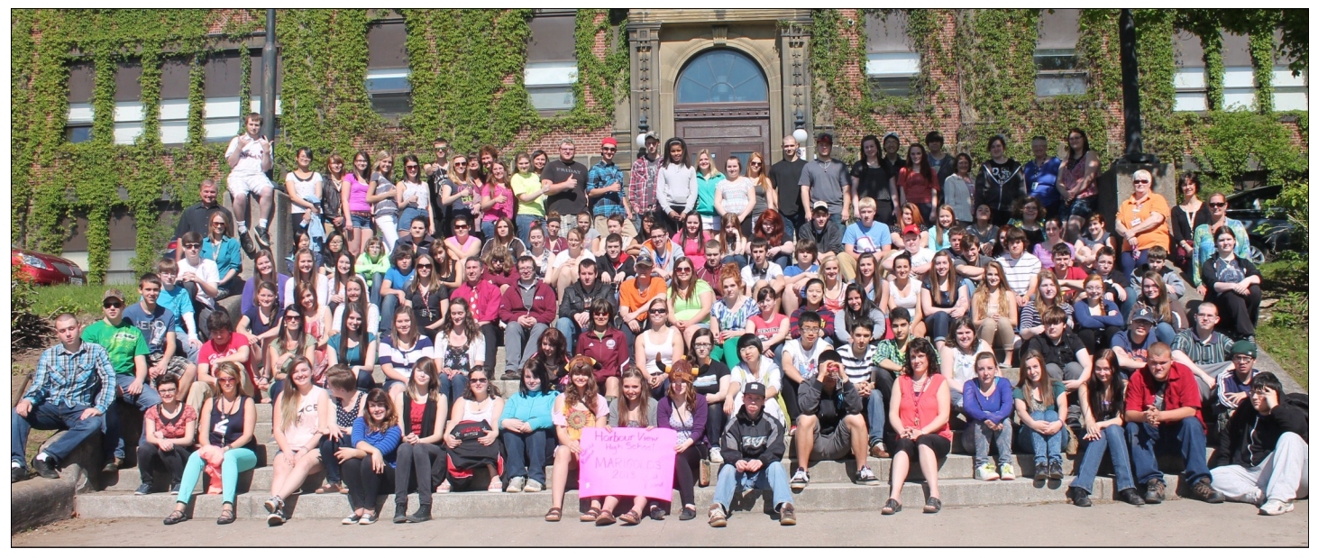
On June 6th, students helped the Marigolds on Main initiative break the Guinness World Record for the most people simultaneously planting flowers.