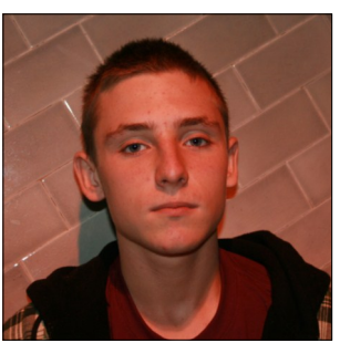
In a lot of ways high school is easy compared to middle school.